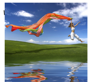
Embrace the Forgotten Feminine..

THE FORGOTTEN FEMININE http://theforgottenfeminine.com/